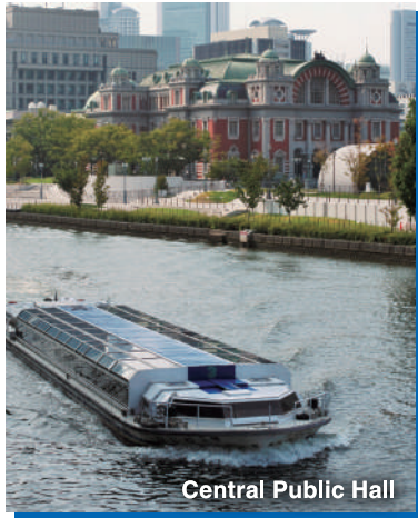
Central Public Hall