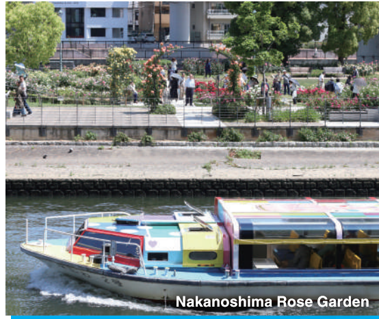
Nakanoshima Rose Garden